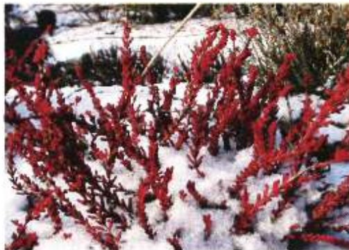
Calluna vulgaris "Multicolor" in the snow

Our winter meeting promises To be a very enjoyable time.